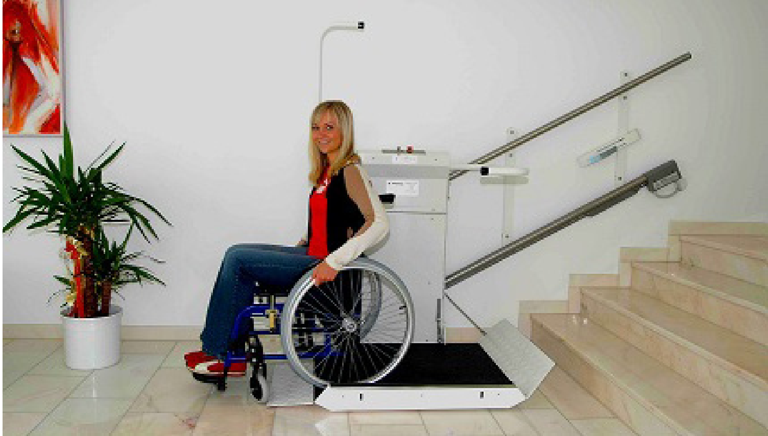
An elegant and modern lift that fits smoothly into any environment