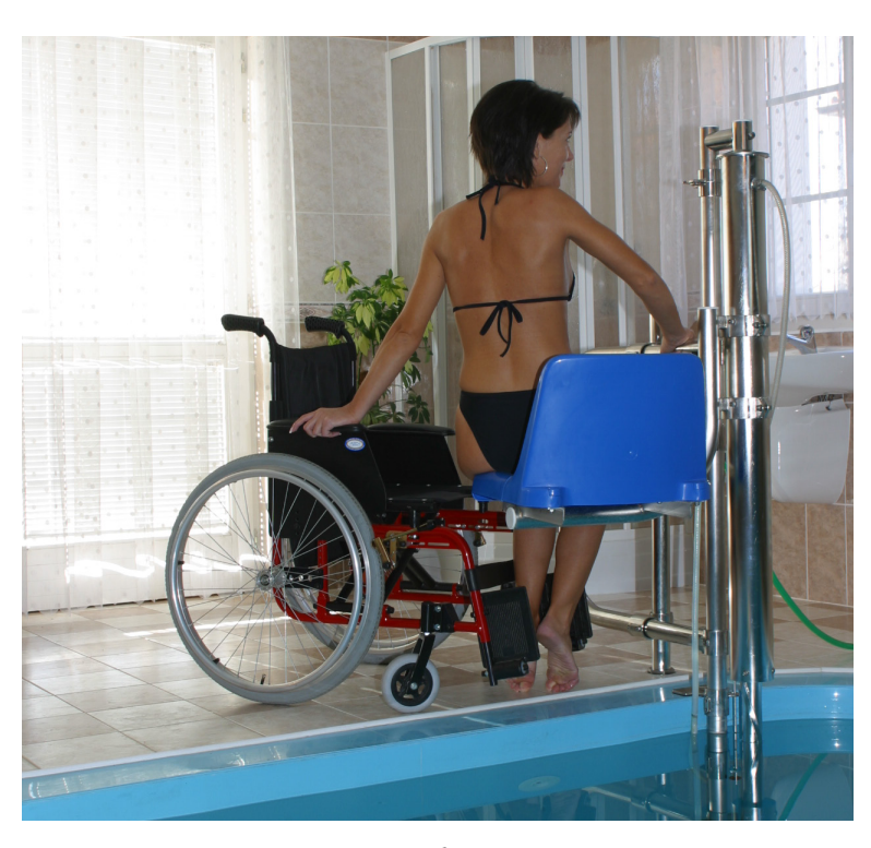
Lifting between chairs without great effort and without any help