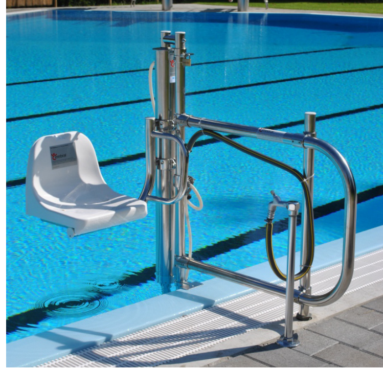
Elegant design makes the poollift fit perfectly into public and private pool environements