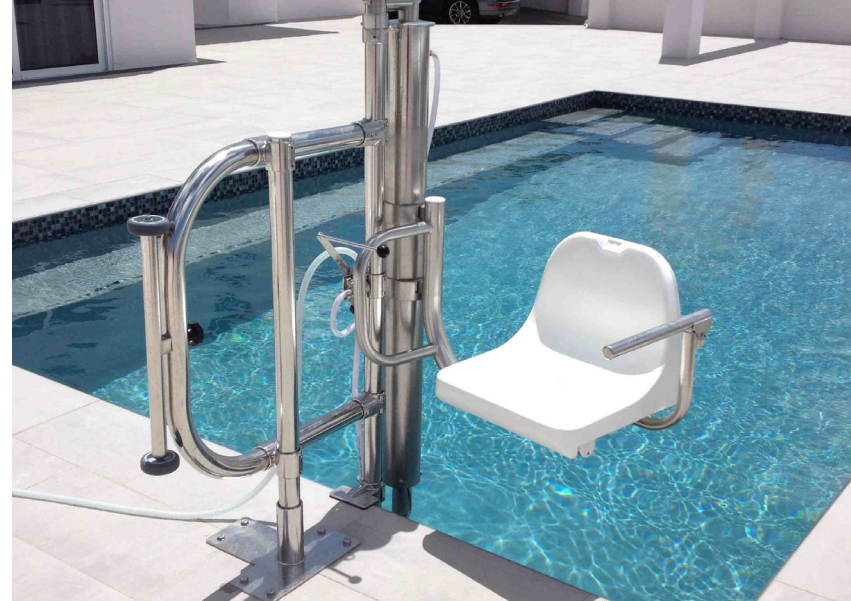
Foldable armrest allows for a extra feeling of safety during lifting and lowering of the chair