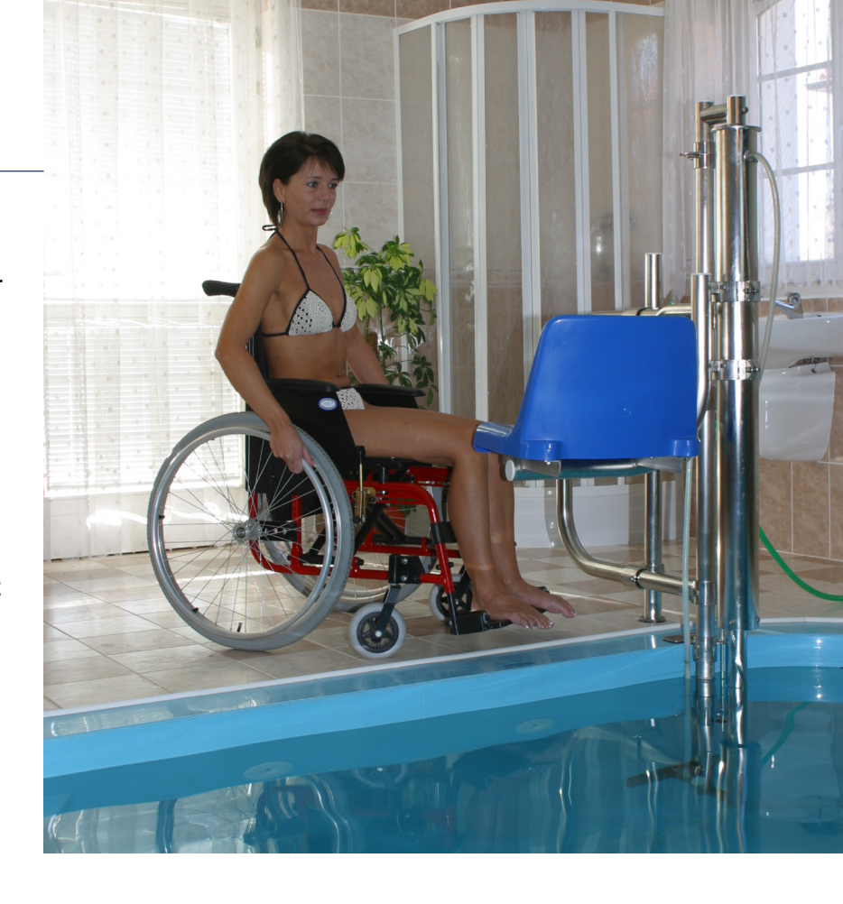
The stable structure assures a safe and smooth transfer to the pool

Running on water pressure only this lift never fails to work and has no electrical components.