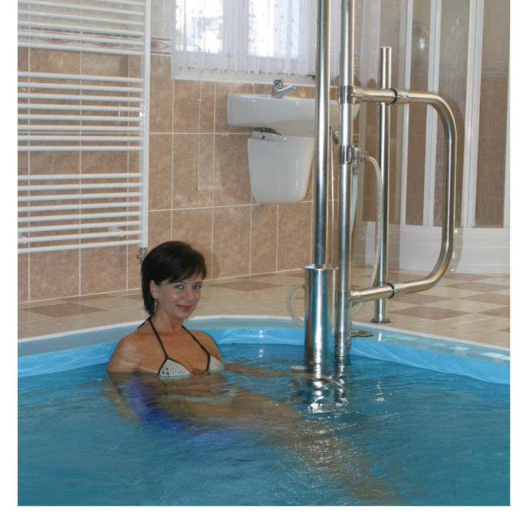
Control levers at entrance as well as at pool level allow for for independent control of the poollift