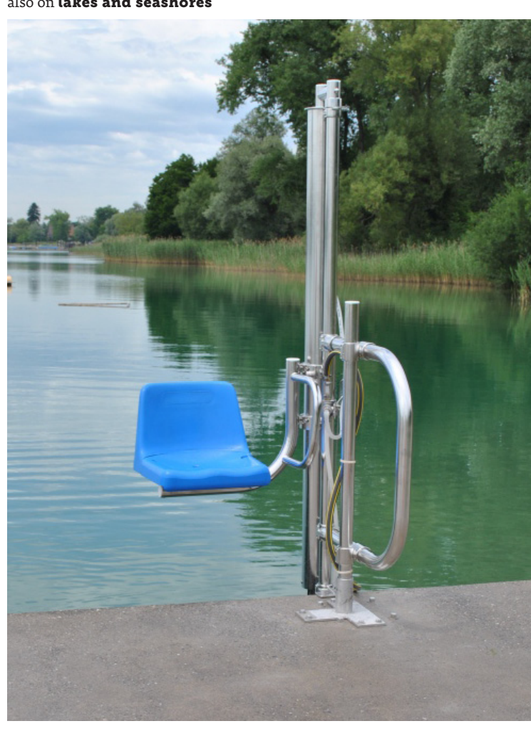
The stainless steel lift can be installed also on lakes and seashores